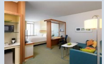
Photos from Marriott SpringHill Suites

We have been encouraging those coming to the convention from outside the area to consider coming early or staying after the convention. The hotel is offering the convention rate both 3 days before and 3 days after the convention. We believe those coming to our area for the first time will be impressed by what it has to offer; and for those who have not been here for awhile, we believe they will be intrigued by the changes.