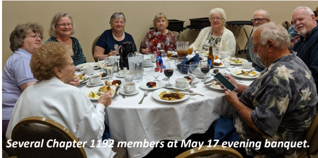
Several Chapter 1192 members at May 17 evening banquet.